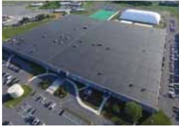
Spooky Nook Sports, largest indoor sports complex in North America

The largest regional sports facility in North America continued capital investment in their East Hempfield facility in 2018. PIDA First Industries Tourism loan funds were utilized to build out and equip a full commercial kitchen to support the company's growing event business.